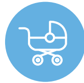
Birth of a child