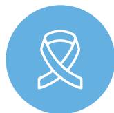
Assets left to a charity