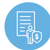
Assets that pass from a trust to a beneficiary