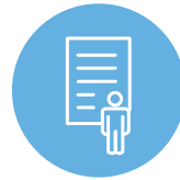
Death of a beneficiary